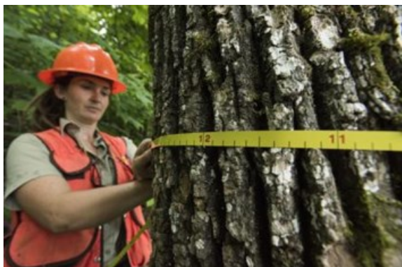
Photo: A USDA Forest Service timber cruiser measures a tree. The TPEP is a cooperative effort with the USDA Forest Service and USDA Rural Development.

Cooperatives like the TPCE are businesses owned and managed by their members in order to serve the shared needs of their members. Some 56 loggers from Wisconsin and Michigan formed the TPCE about five years ago to help create places where loggers can have a vested interest in where they take their product for processing.