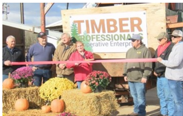
Photo: Members of the Timber Professionals Cooperative Enterprises cut a ribbon, celebrating the re-opening of a sawmill in Tilleda, Wisconsin.

On a warm day last October, a celebratory group gathered to cut a ribbon officializing the re-start of the mill, which had sat quietly idle for one year. The mill is on 49 acres located about 12 miles west of Shawano and two miles north of bustling State Trunk Highway 29.