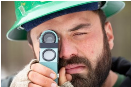
Photo: A USDA Forest Service timber cruiser uses a loupe (a pocket magnifier) to assess trees. The TPEP is a cooperative effort with the USDA Forest Service and USDA Rural Development.

As the number of mills has diminished, the number of jobs for people in rural Wisconsin has declined. The re-opening of the mill in Tilleda will create six jobs, with additional staffing added as the sawmill expands.